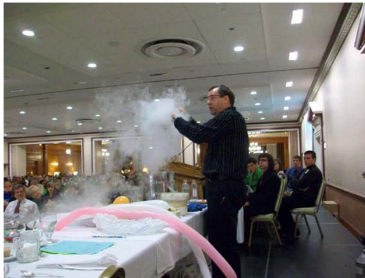
Mr. Freeze at the 2009 IJAS banquet.

Son of Citation Machine™ http://citationmachine.net/index2.php