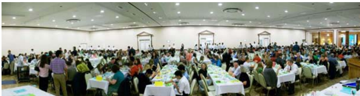
The IJAS banquet at the University of Illinois

All participants at all local, regional, and state expositions, to assure safety and minimize confusion, should follow the rules and regulations described and detailed in this policy manual.